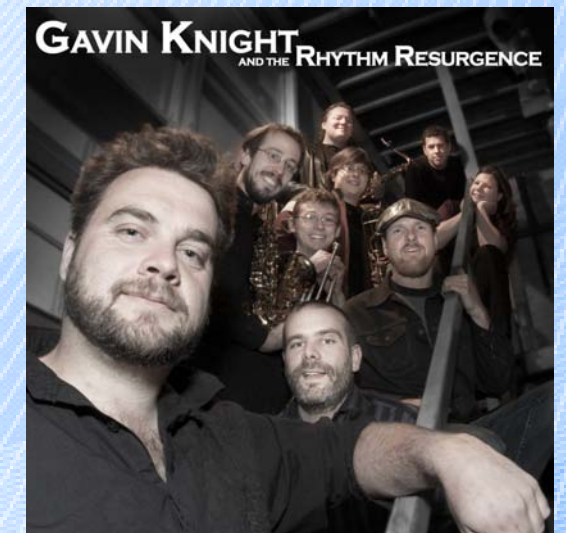
Rhythm Resurgence After dinner, unwind to the lively, soulful sounds of your favourite pop artists with a Motown twist.