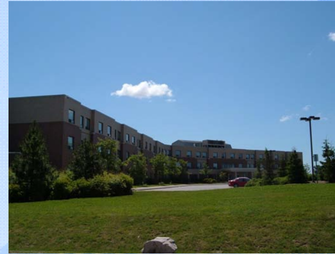
Seneca Residence & Conference Centre