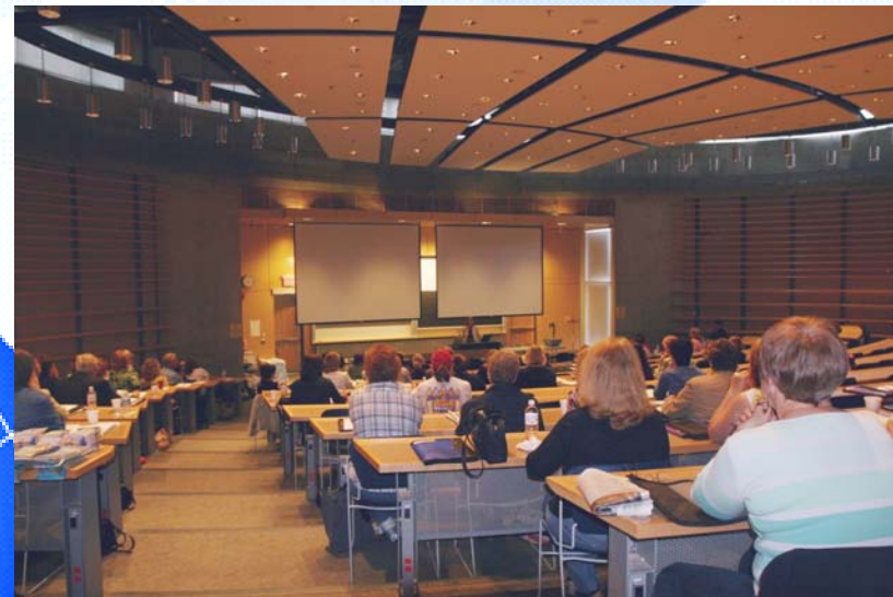
Share ideas and expertise at the plenary sessions.