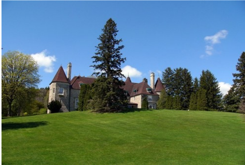
Historic Eaton Hall, Seneca College, King Campus

June 1, 2 & 3, 2009 Seneca College King Campus